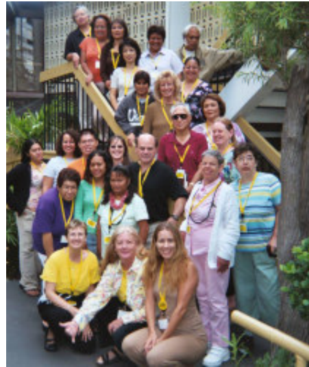
The Partners in Policymaking 12th Academy participants pose at the Pagoda Hotel.